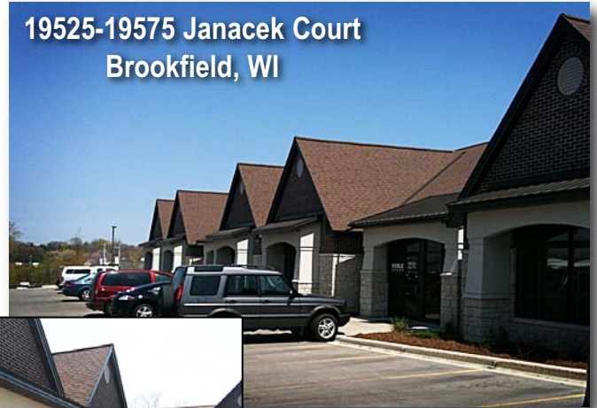
19525-19575 Janacek Court Brookfield, WI