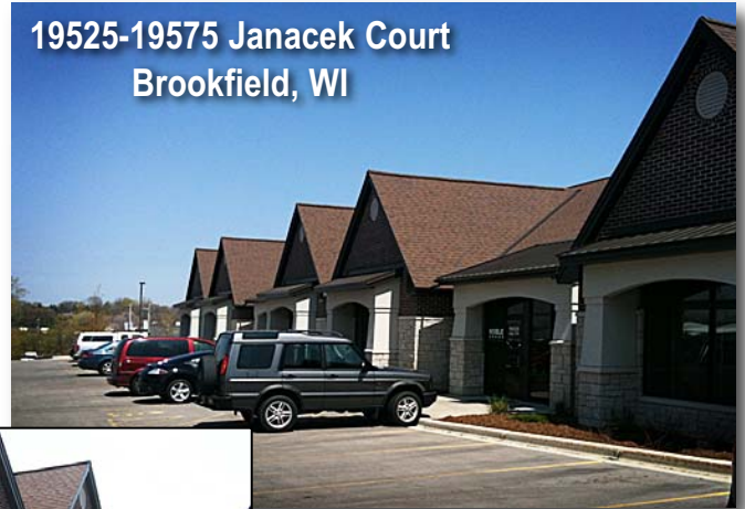
19525-19575 Janacek Court Brookfield, WI

Located just south of the highly traveled Bluemound corridor, this new development sits on the southeast corner of Janacek Court and N. Janacek Road. The property features excellent access to I-94 and is in close proximity to restaurants, shops, and hotels. Customize your office space today!