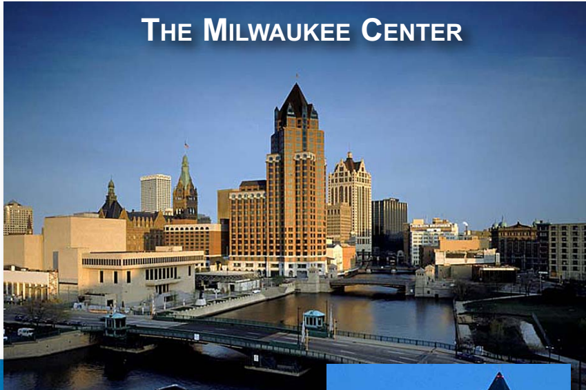
THE MILWAUKEE CENTER