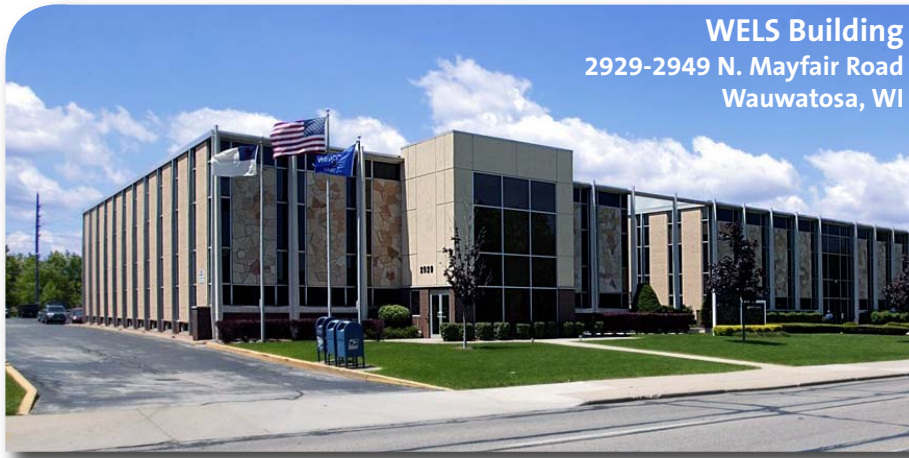
WELS Building 2929-2949 N. Mayfair Road Wauwatosa, WI