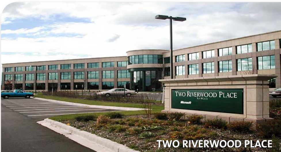
TWO RIVERWOOD PLACE

N19 W24133 Riverwood Drive, Pewaukee, WI