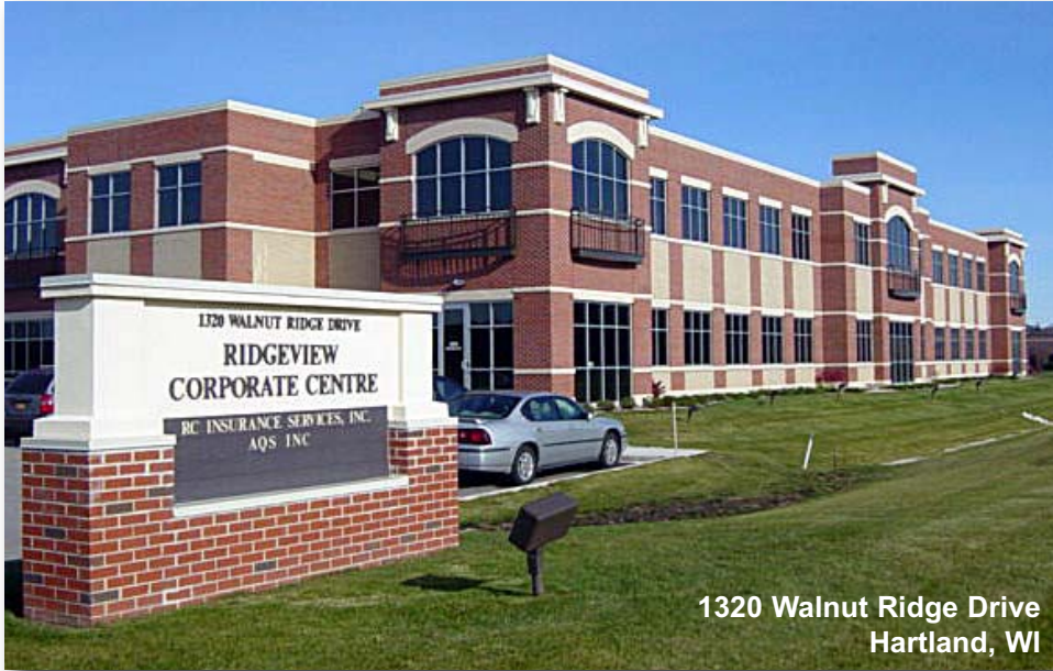
1320 Walnut Ridge Drive Hartland, WI